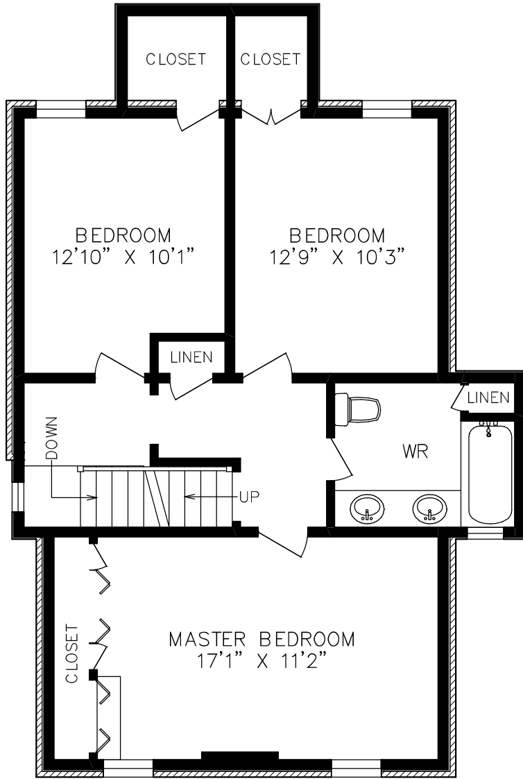
SECOND FLOOR 822 SQUARE FEET